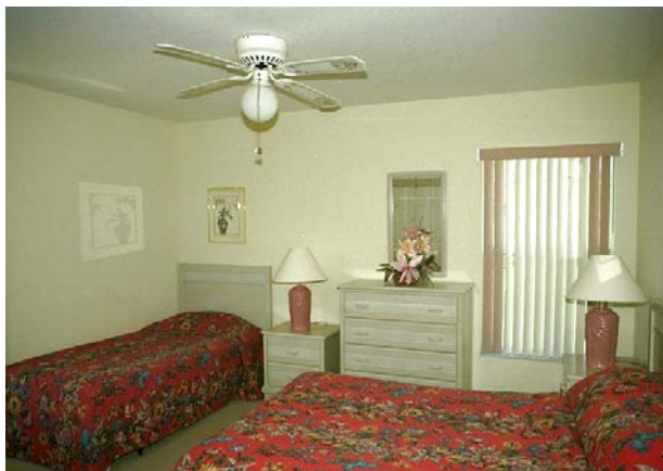
The second bedroom with both a double and a single bed.

A third has twin beds and vanity unit, whilst a queen size bed-settee in the lounge, provides additional sleeping accommodation. The kitchen with its breakfast area, is fully equipped with all modern conveniences including large fridge-freezer with ice-maker, cooker, microwave oven, dishwasher, coffee maker, waste disposal unit and all the necessary utensils and crockery. A laundry room with washing machine and tumble drier leads to the integral double garage.