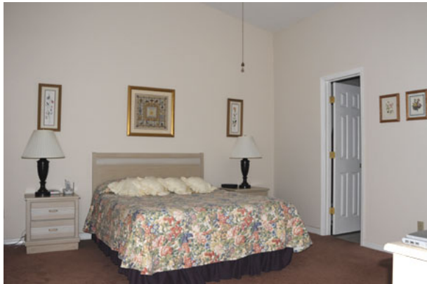
The master bedroom, with en-suite bathroom, walk-in closet and sliding doors to the porch and deck.